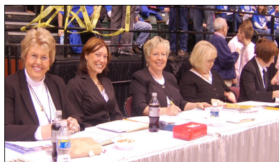
2010 Cheer Final Photos...page 3